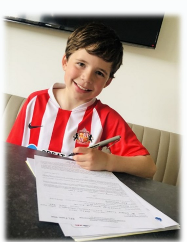
Well done, Harry - what a fantastic achievement!